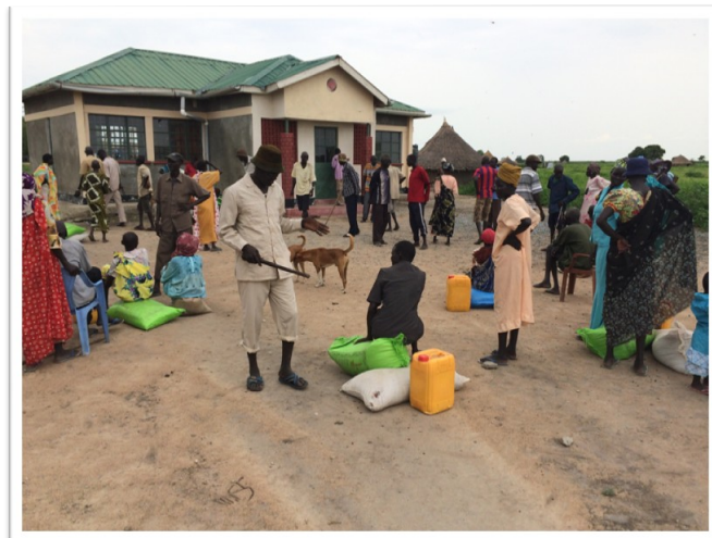
Food delivery at the Buckeye Health Clinic