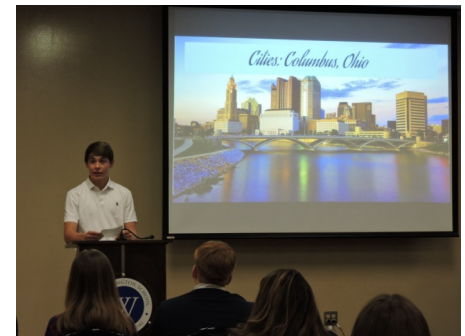
Student Presentation Night