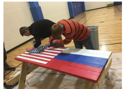
Volunteering at the YMCA