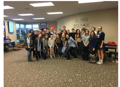
Whole group photo at Wellington

Visit our website for more details and photos!