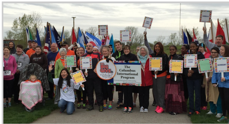
Columbus International 5K race participants