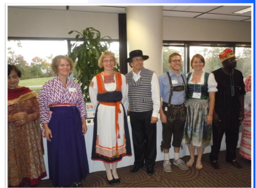
International Attire Contest at the 40th International Taste of Columbus. See more pictures from the Taste on page 4.