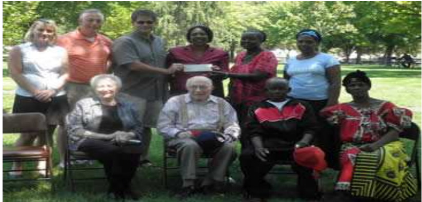
The first check presentation made to the Rwandan Women in Action in August 2010.