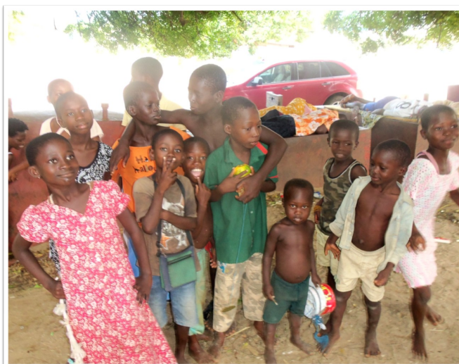
The structures and children that Divine Favours supports in Ghana